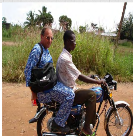
I travel around Togo by public transportation such as inter-city taxis and motorcycle taxis.