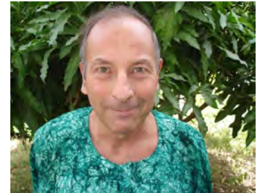
Behind me in my yard in Kara is a mango tree, so I can eat grafted mangos in April. I also have papaya, banana, orange and lemon trees growing in my yard. I really miss tropical fruit while on furlough in the U.S.