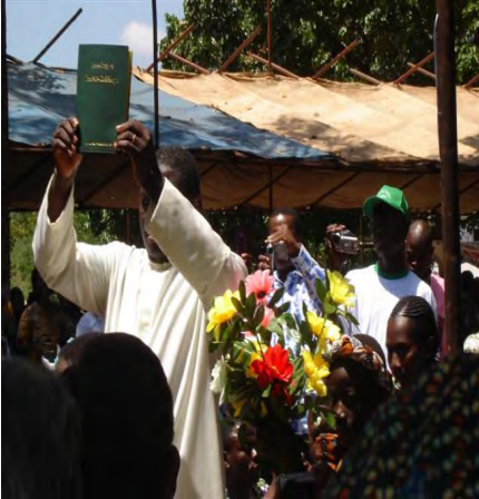
People celebrating receiving the Bible in their own language.

Thank you for being my prayer and financial partners. I couldn't do it without you, and feel privileged to be on the same team with you, honoring God by seeing his Message made available to everyone in the language they understand best. "The greatest missionary is the Bible in the mother tongue. It never needs a furlough, and is never considered a foreigner." -- Cameron Townsend, Wycliffe founder